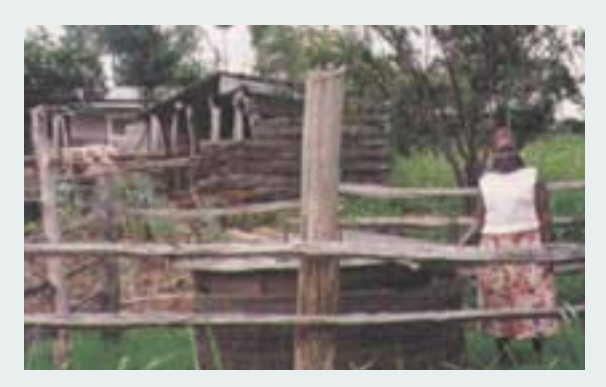
A biogas digester installed by CITC Kapsabet using its line of credit from KGT

This project has impacted tremendously on this community living in a harsh climatic environment and demonstrated the value of partnerships (with other NGOs and communities) in development.